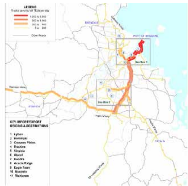
Figure 3: TEU movements